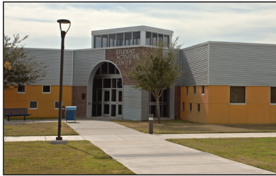
Starr County Campus